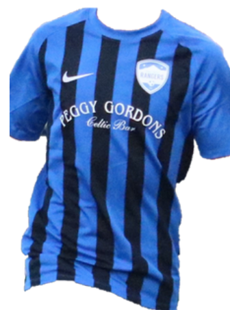
LUKE SNELLGROVE STRIKER