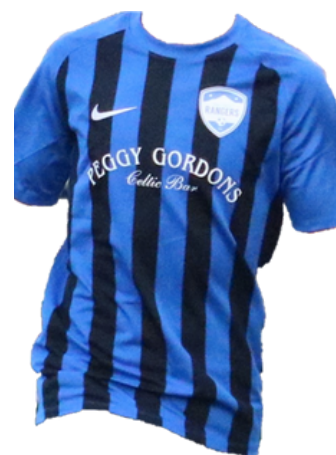
LUKE SNELLGROVE STRIKER